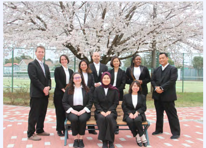
A team of global minds, connecting cultures through language at TNUSS.

We're just getting started! Have an idea, a fun fact, or a cool story to share? We want to hear from you! The more you share, the better this newsletter becomes. Let's keep the good vibes going and make TNUSS Voices the heart of our school stories!