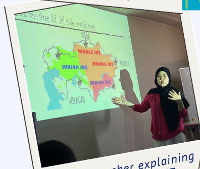
Kazakh teacher explaining the 3 types of JUZ