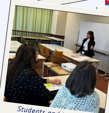
Students and teachers exploring unique Filipino English expressions