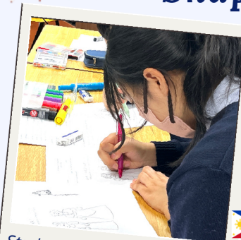
Student designing a modern take on Baro't Saya