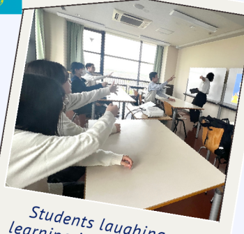
Students laughing and learning in Spanish class