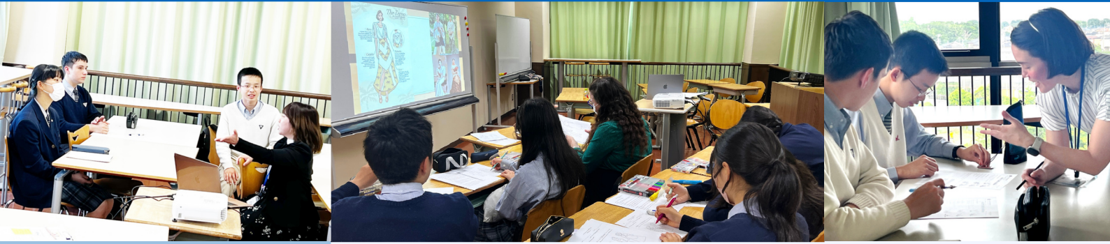
Students dive into global perspectives with the launch of Global Cultures and Global Voices .