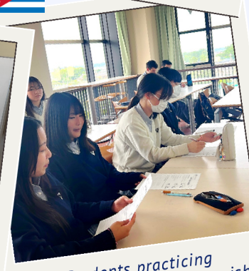
Students practicing self-introductions in Spanish